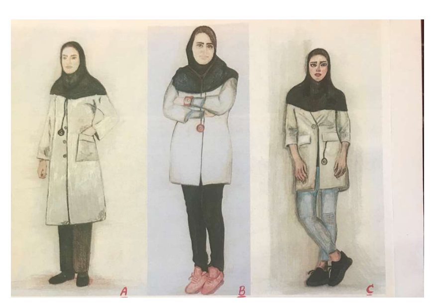
Figure 1. The schematic images of female interns' professional dressings. A: hijab, no-makeup looks, long and loose uniform, cotton pants, orthopedic shoes B: hair out, without makeup, short and tight uniform, tight and bright pants, sport shoes C: hair out, with makeup, short and tight uniform, short and tight jeans, sport shoes

A descriptive-analytic cross-sectional study was carried out at Kerman University of Medical Sciences (KMUS), Kerman province in southeastern Iran from May to September 2018.