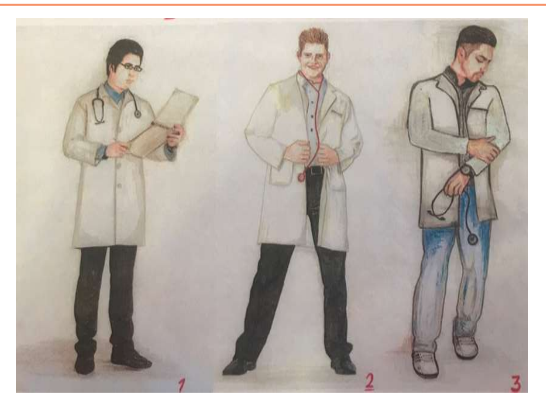
Figure 2. The schematic images of male interns' professional dressings. 1: ordinary hairdressing, standard dress with closed buttons, cotton trousers, orthopedic shoes 2: special hairdressing, standard dress with open buttons, casual pants, orthopedic shoes 3: special hairdressing, short dress with open buttons, jeans, sport shoes

The statistical populations were all patients, who have been admitted to the internal medicine, surgery, pediatrics, and gynecology departments during the study period and all physicians working in these departments.